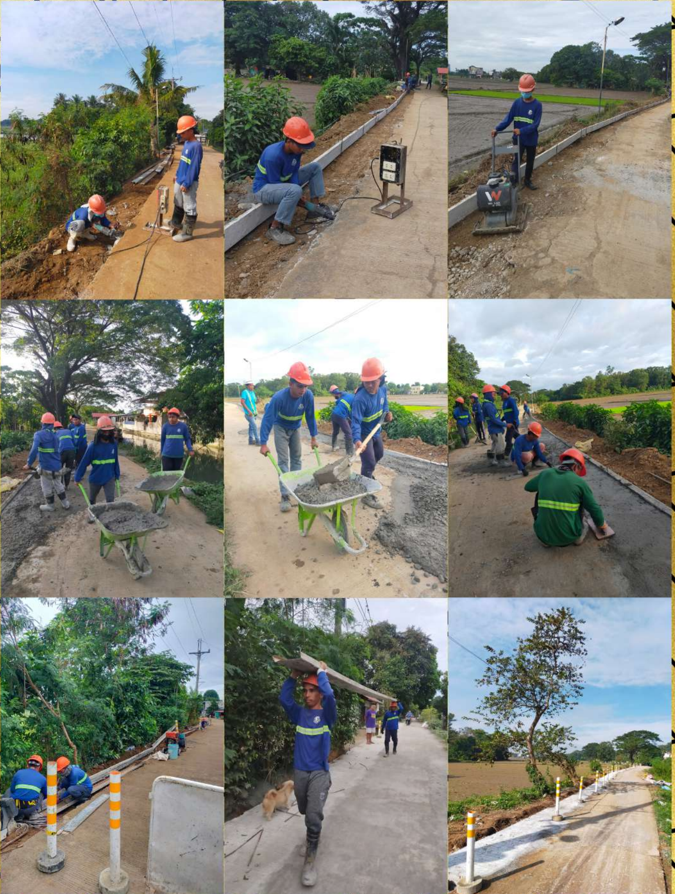
Brgy. Sipat – Restoration